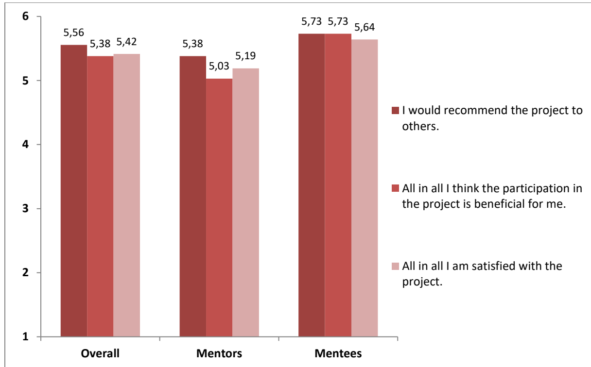
Figure 1. Participants' satisfaction with the imos project. Mean values of the overall participants, mentors and mentees are displayed (answer options: 1 [strongly disagree], 2 [disagree], 3 [somewhat disagree], 4 [somewhat agree], 5 [agree], 6 [strongly agree]).