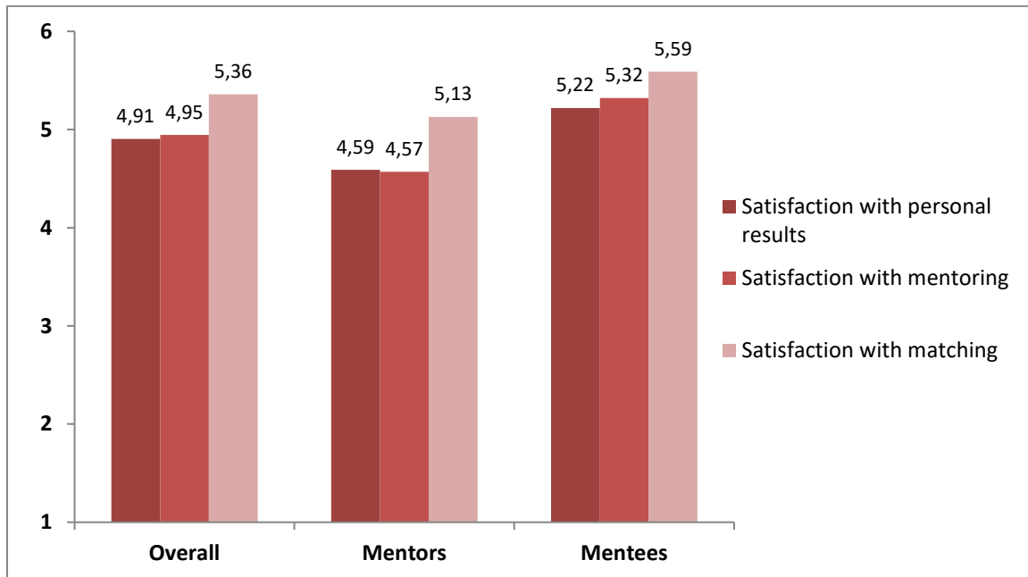
Figure 2. Participants' satisfaction with the mentoring. Mean values of the overall participants, mentors and mentees are displayed (answer options: 1 [strongly disagree], 2 [disagree], 3 [somewhat disagree], 4 [somewhat agree], 5 [agree], 6 [strongly agree]). 1