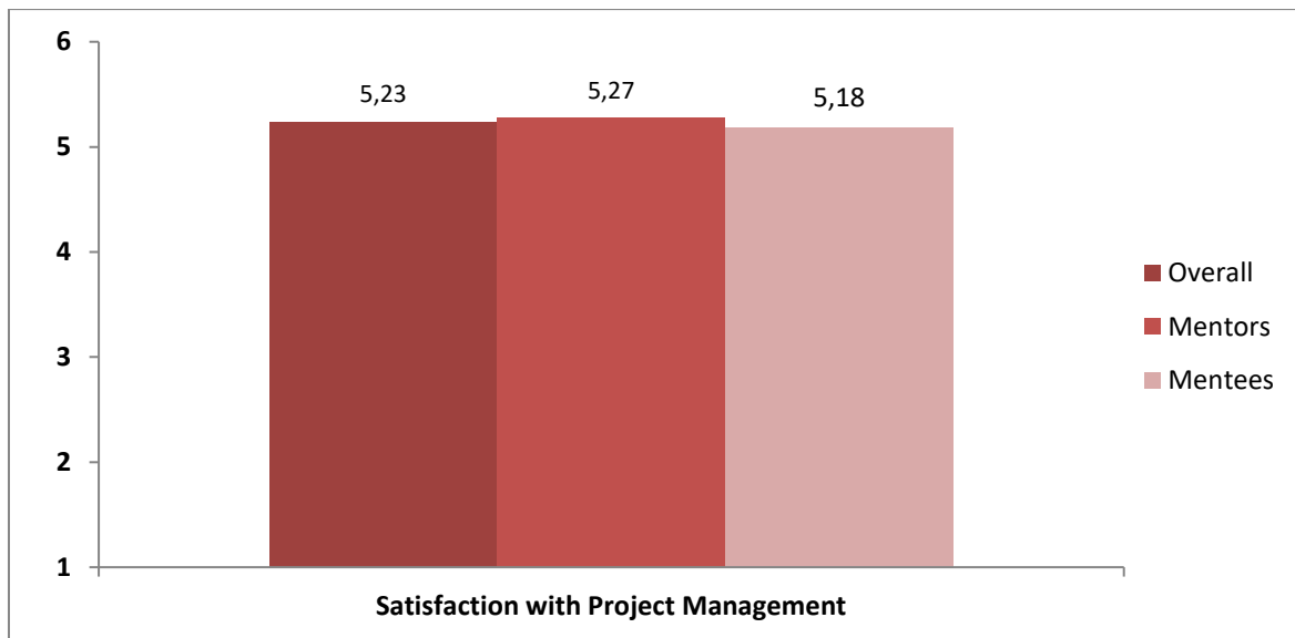
Figure 3. Participants' Satisfaction with the imos project management. Mean values of the overall participants, mentors and mentees are displayed (answer options: 1 [strongly disagree], 2 [disagree], 3 [somewhat disagree], 4 [somewhat agree], 5 [agree], 6 [strongly agree]). 1